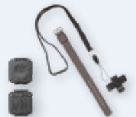
Medical & panic transmitters