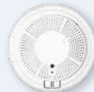
Combination smoke/CO detector