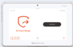
7" Touchscreen Display (Wireless)